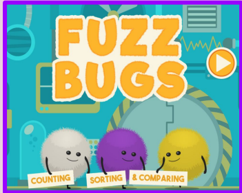
Counting, Sorting, and Comparing